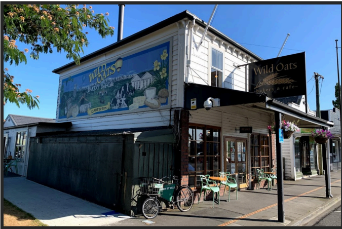
Wild Oats Cafe, Carterton