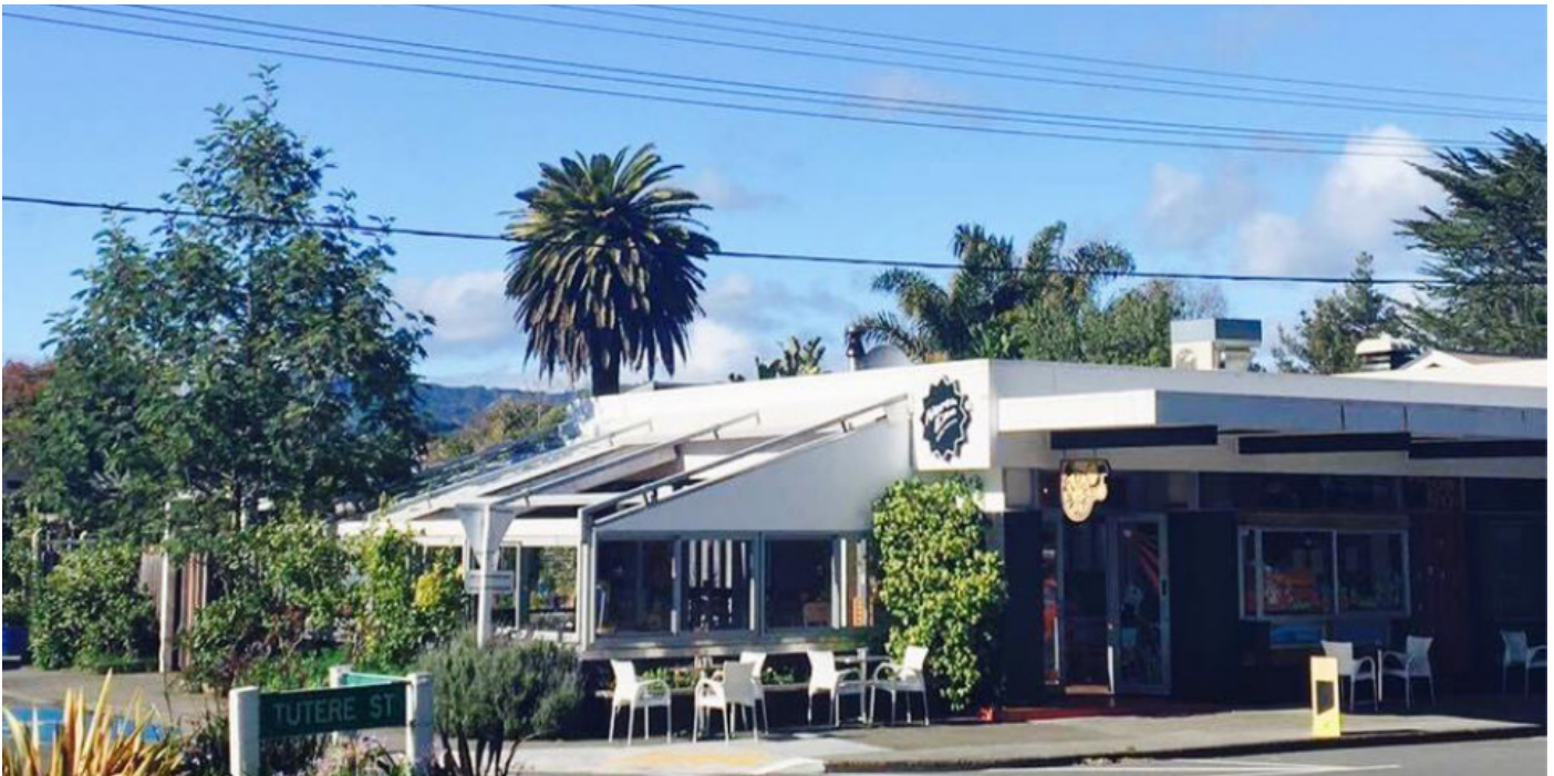
* Long Beach Cafe (Image downloaded from the web - low res)

Thankfully, none of our riders had any incidents and we all arrived at the Long Beach Café and had lunch and coffees which was of high standard as was the service. After lunch we departed for home