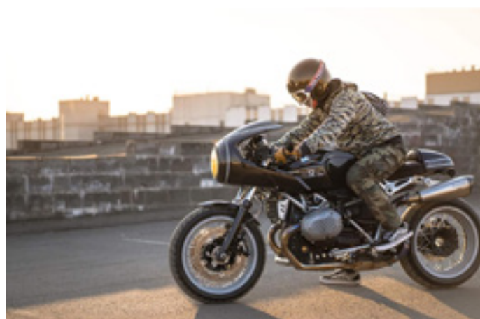
Instagram - @ishootbikes