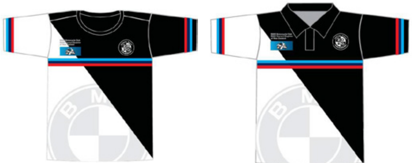
WOMENS POLO SHIRT

Illustrations not drawn to scale, final design may vary slightly.