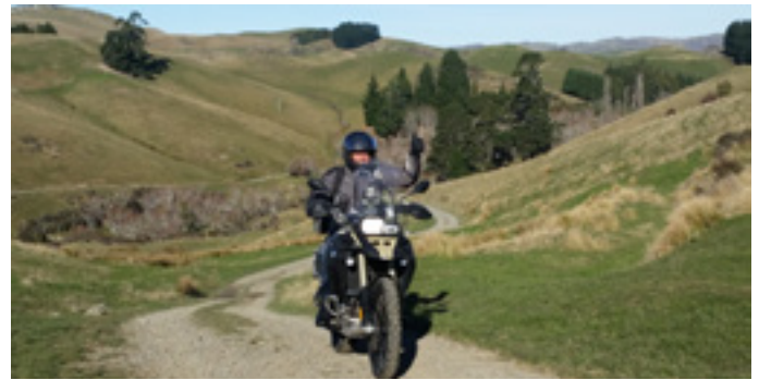
Kaiwara road, Happy biker