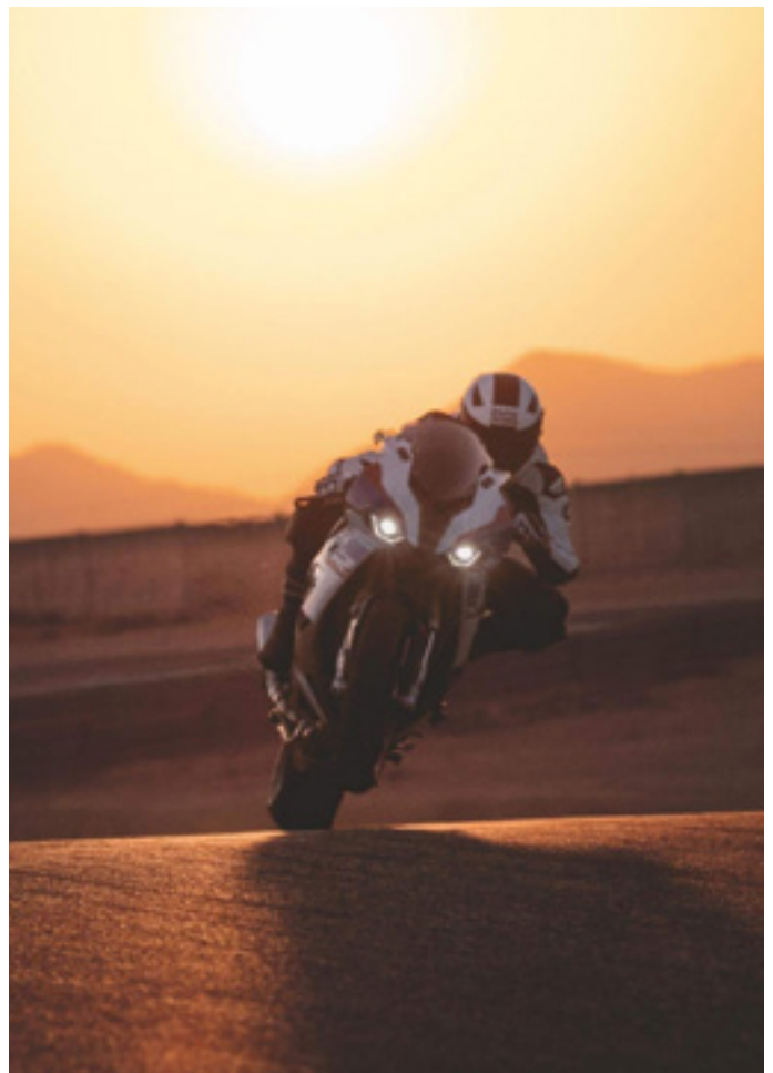
#NeverStopChallenging - Facebook