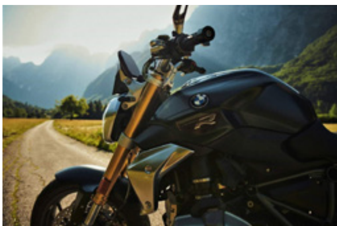
BMW R 1250 R - Facebook