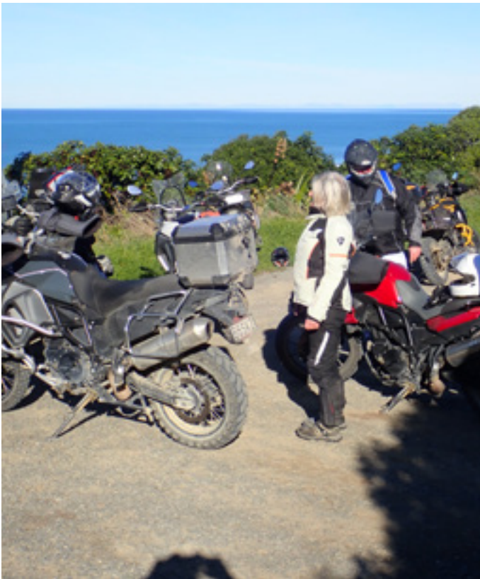
Crisp sunny day - North Canterbury - Hurunui River mouth