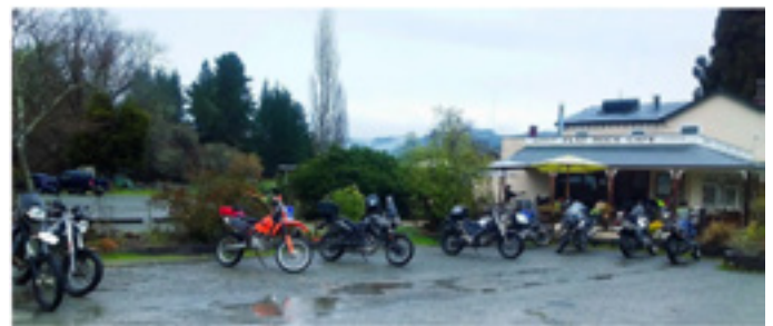
Kohatu Flat Rock Cafe

A big thanks to Anja for obtaining the permits and organising the day.