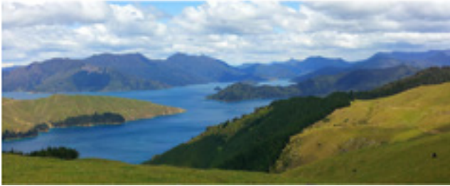
French Pass, Marlborough Sounds

Friday 24 th to Monday 27 th January | Hosted by Nelson Area BMWOR