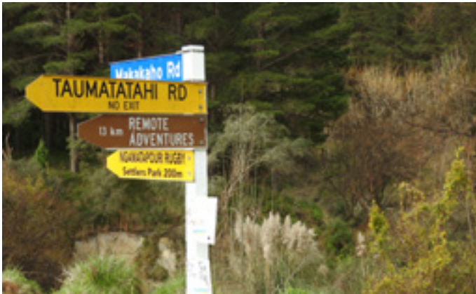
Signpost at junction by school