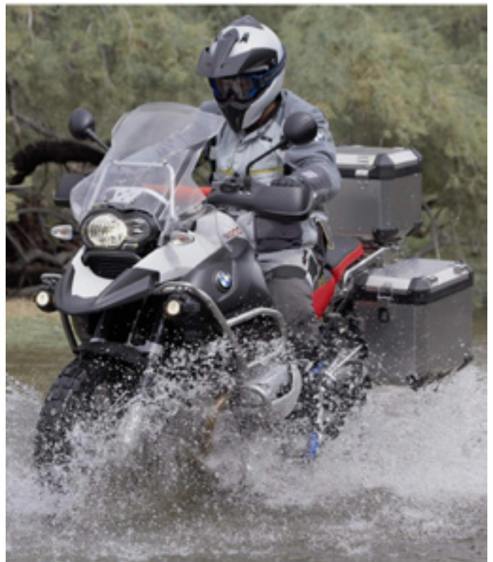
R1200GS Adventure 2006 - Facebook

DISCLAIMER: Registration fee is non-refundable. Special applications may be considered. This Rally will be run under the BMW Owners Register Risk Management Plan as in the club's official newsletter. By registering for this event participants agree to abide by all the conditions of the said Management Plan