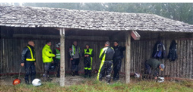
Ride briefing, sheltering from the rain

Our second ride of the month was on the 17 th . 12 riders met in the forestry at the first skid site on Olivers Road (at the top of the Spooners Range), on a rather damp morning. Two riders decided the conditions were not ideal and headed on home. Dale suggested we head over the way and take shelter under some trees, which involved driving across the slightly muddy skid site and turning into a muddy side road and stopping in front of a large muddy puddle filled with tree roots. There was no more shelter here and Tony advised us that there was a shelter, about 1km up the track that we could use.