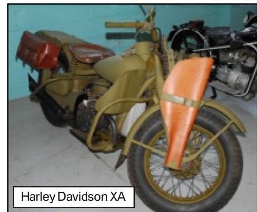
Harley Davidson XA