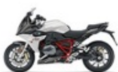
BMW R 1200 RS