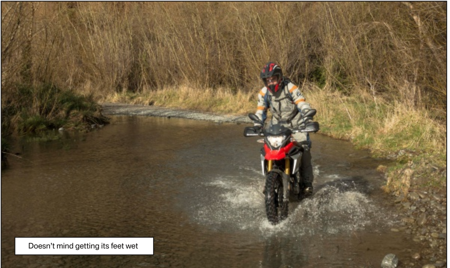
Doesn't mind getting its feet wet

Chassis-wise, the 310GS is very comfortable and nimble, yet quite predictable on the road. The bar, levers, pegs and seat position fit my 185cm stature well. I was super impressed with how well the 310GS easily negotiates corners.