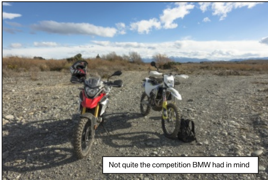
Not quite the competition BMW had in mind

Having said that, Rally Raid Products are gearing up their Suspension Upgrade Kits, Spoked Wheel Kits and other Accessories for the G310GS. Now there's an interesting prospect!