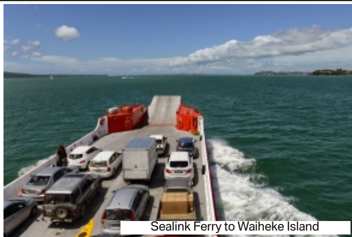
Sealink Ferry to Waiheke Island