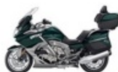
BMW K 1600 GTL