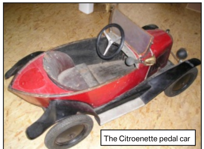
The Citroenette pedal car

From 1959 until 1962 Ratier made motorcycles, having taken over the motorcycle business of the Centre d'Études de Moteurs à Explosion et à Combustion (CEMEC). The engines were flat-twins derived from Second World War BMW designs. As a victory spoil, it was the recipient of many motorcycle parts from the German company BMW and the company was able to construct its own motorcycles,