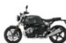
BMW R nineT Pure