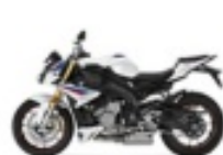
BMW S 1000 R