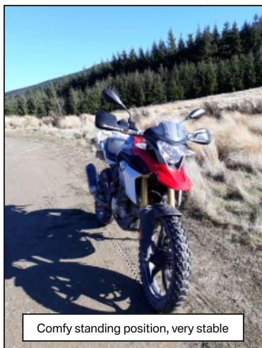
Comfy standing position, very stable

It's a great route with around 20km of seal along Old West Coast Road before a right turn onto gravel to the river and a plethora of rocky tracks and river trails. There's unlimited access to the river bed itself, which is mix of (very) rocky, sandy and muddy terrain. It's only about 20kms to the bridge as the crow flies, but you can spend a long time getting there if you do choose an obscure route, which we did, before a short 15km sprint to Oxford.