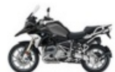
BMW R 1200 GS