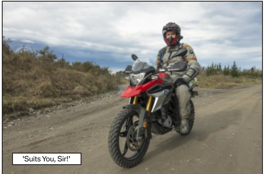
'Suits You, Sir!'

The plan was to meet a couple of mates at Yaldhurst Caltex and ride up the southern side of the Waimakariri River to the Waimakariri Gorge Bridge then head into Oxford for a late lunch.