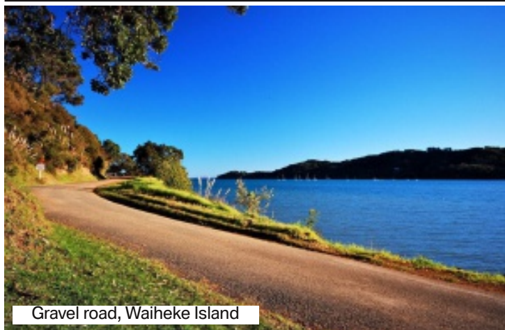
Gravel road, Waiheke Island