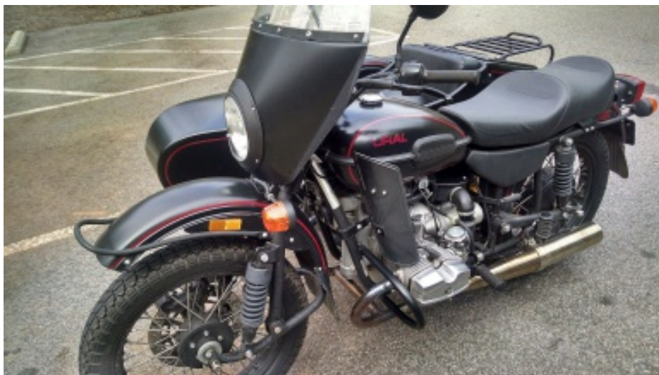
Photo (above): 2009 Ural "T" with sidecar, satin powder coat finish and red detail. Credit to Wikipedia for above article Link: https://en.wikipedia.org/wiki/IMZ-Ural

The export history of Urals started in 1953, at first to developing countries. Between 1973 and 1979, Ural was one of the makes marketed by SATRA in the UK as Cossack motorcycles.